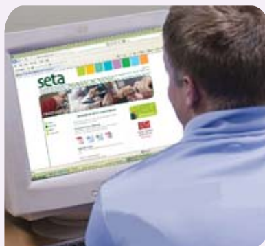
The new resources web site