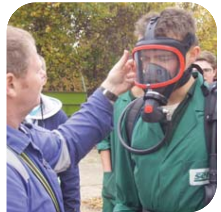
Breathe deeply...see inside