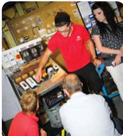
Esso Apprentices show off their project